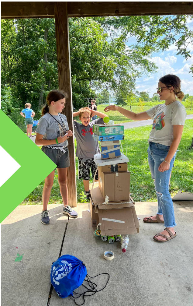
STEM Recycled Tower Contest